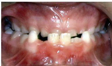
Complete Class III